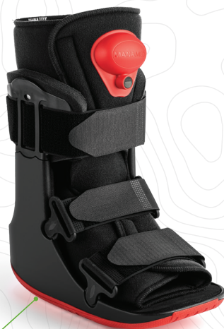
MAC SHORT BOOT