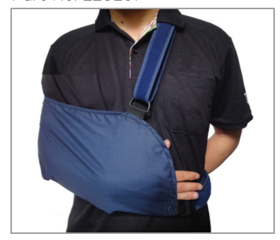
ManaEZ Sling Shoulder Immobilizer with Waist Strap